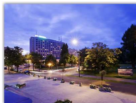
Orbis Gdynia Hotel

(H3417-RE1@accor.com) not later than 31st of May about your arrival and departure.