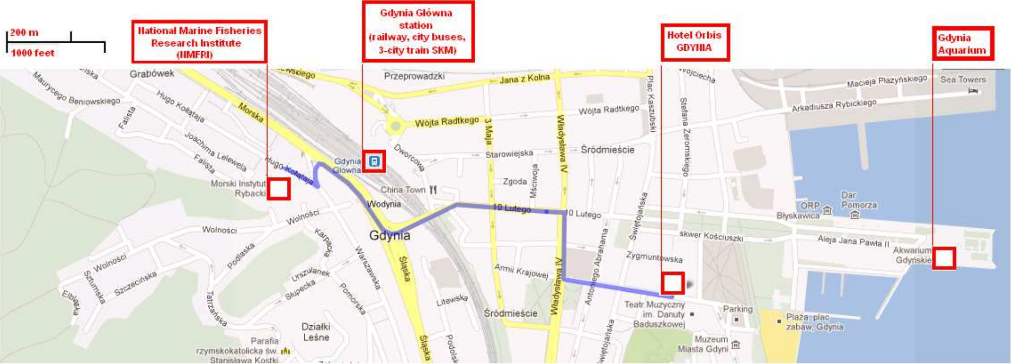
Picture 4: Way from the Orbis Gdynia Hotel to National Marine Fisheries Research Institute (PL: Morski Instytut Rybacki – PIB).