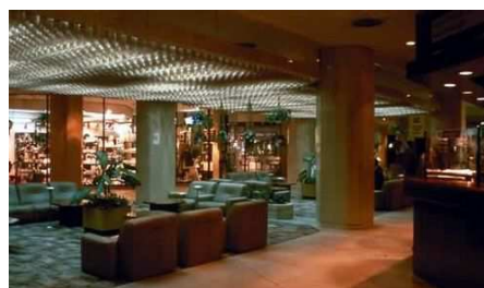
Orbis Gdynia Hotel reception