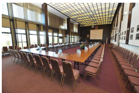
Sala Demela – conference room

National Marine Fisheries Research Institute (in Polish: Morski Instytut Rybacki - PIB ) ul Kollataja 1 81-332 Gdynia