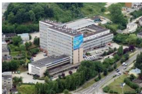
National Marine Fisheries Research Institute